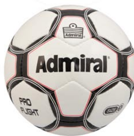
#4075 Pro Flight Sizes 4 & 5

Distinct in its surface finish; the Aerial Pro combines the proven qualities of the Pro Flight with added performance of Admiral's Air Mattress System. Superior touch and control are the key features of this 1.5mm PU 4 fold casing with latex bladder offering.