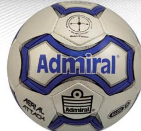
#4004 AERIAL ATTACK Sizes 3, 4 & 5

Professional Match Ball Standard quality. A 1.5 mm PU Microfibre casing proves itself amongst the game's elite. Equipped with a PK latex bladder for optimal performance, the Premier Flight will meet all your match ball requirements. NFHS Approved.