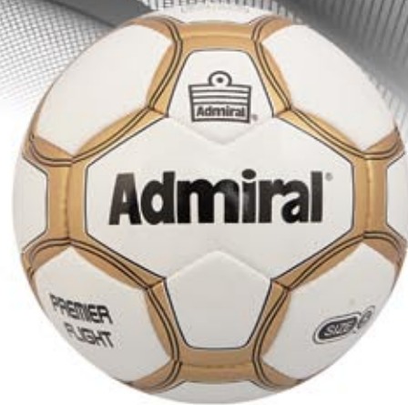
#4006 Premier Flight Sizes 4 & 5

Admiral's elite ball. Offering features a 1.5 mm PU Microfibre casing is further enhanced with Admiral's Air Mattress System and a superior PK Latex bladder. The Aerial Premier will take your game to new heights!