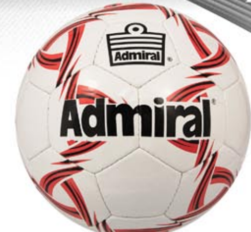
#4008 BRASILIA Sizes 3, 4 & 5

Entry priced ball featuring a 4 fold 1.0 mm PU casing! Equipped with a butyl bladder, the Aerial Attack is the ideal club or team practice ball.