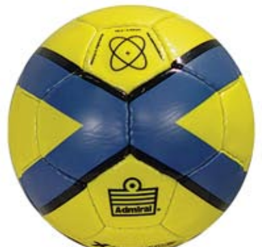
# 4077 Mini Xtreme Size 2

Like its design, this ball is engineered to last. Featuring high density 1.4 mm PU/PVC carbonium lamination casing and a butyl bladder.