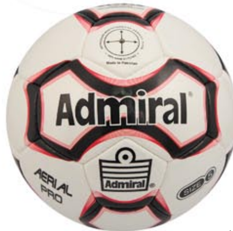
#4005 Aerial Pro Sizes 4 & 5

New. The Brasilia is a training ball constructed from a 1.4mm PVC cover. 3 ply PV lamination and butyl bladder. Customization available.