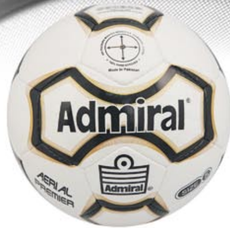
#4007 Aerial Premier Sizes 4 & 5

Admiral's elite ball. Offering features a 1.5 mm PU Microfibre casing is further enhanced with Admiral's Air Mattress System and a superior PK Latex bladder. The Aerial Premier will take your game to new heights!