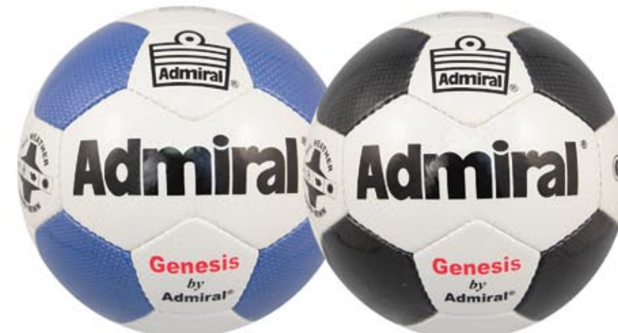
#4003 GENESIS Sizes 3, 4 & 5

Competitive Match Ball with proven quality. Soft and lively. 1.5mm PU 4 fold casing. Latex bladder. Superior ball. NFHS Approved.