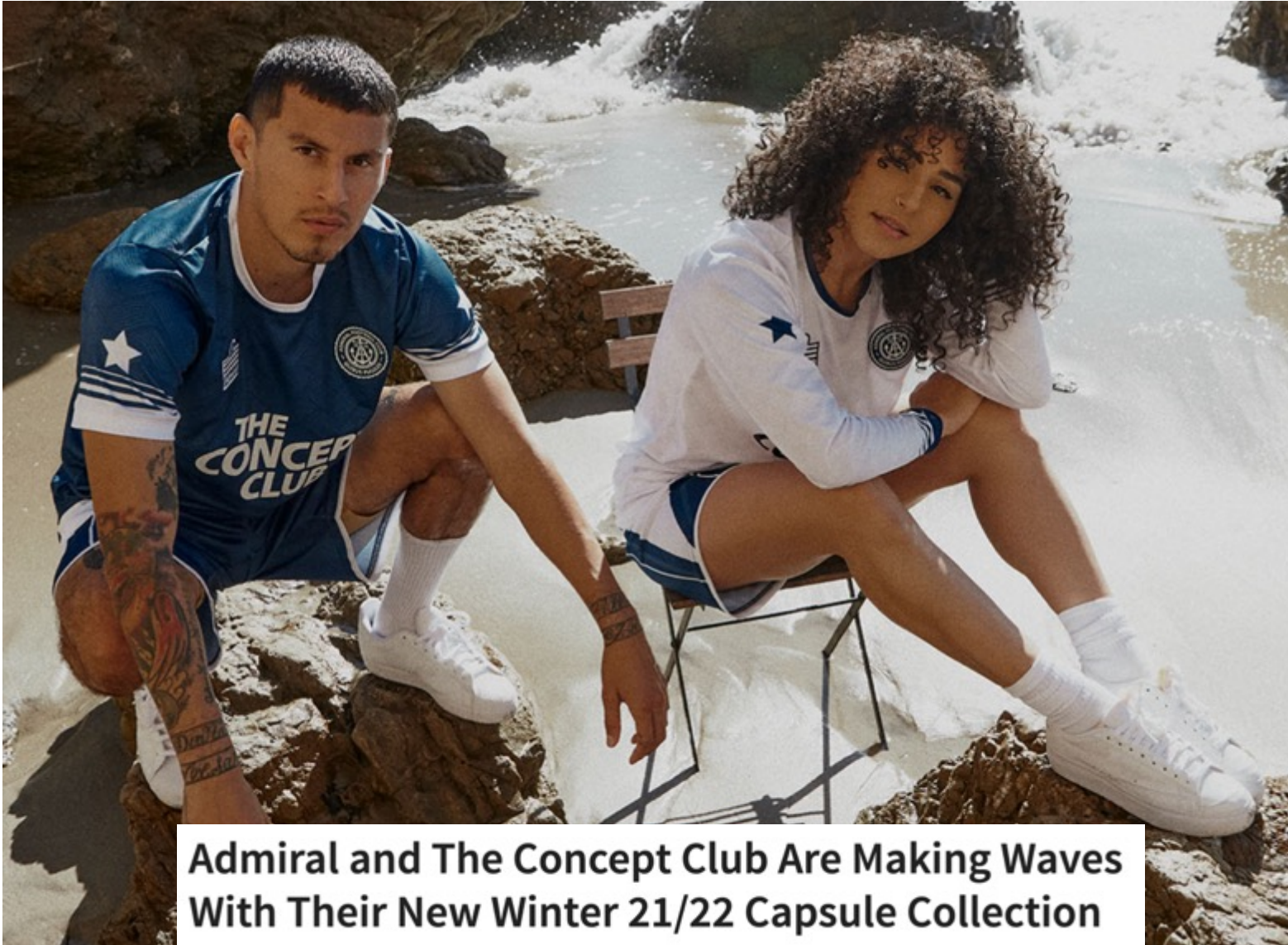
Admiral and The Concept Club Are Making Waves With Their New Winter 21/22 Capsule Collection